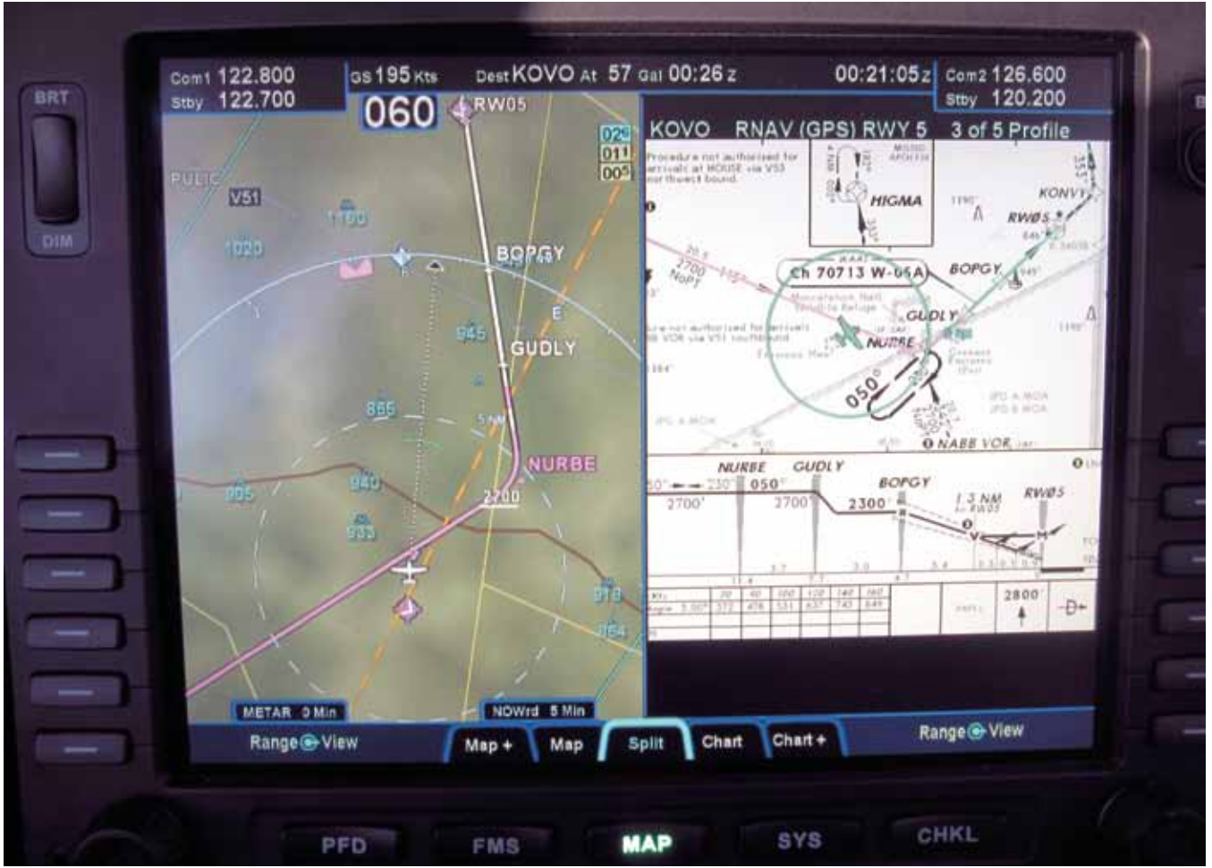
A favorite R9 feature for the author is the split-screen MFD. This is one such option, seeing the traditional moving map and the geo-referenced approach chart simultaneously. Similarly, you could elect to have the flight plan displayed on the right half of the screen. He often uses both options during various phases of instrument approaches.

Next was an autopilot-coupled VOR-only approach. The combination of R9 and DFC-100 takes the stress out of such an "old school" approach. I elected to fly the approach as a GPS-overlay, while simultaneously monitoring the actual VOR radial via a bearing pointer on the HIS, and a textual depiction of the actual radial was displayed in an adjacent data field. The advantage to this method being a more stable navigation signal and, thus, flight path, while still meeting the letter of the law by ensuring my position in relationship to the designated VOR course radial at all times. The DPE was pleased with this methodology and its intuitive presentation within R9. Normally, R9 automatically loads and identifies the appropriate approach frequency, requiring the pilot to simply ensure both were done correctly. In this case, the textual ID for the VOR was incorrect. I've seen this