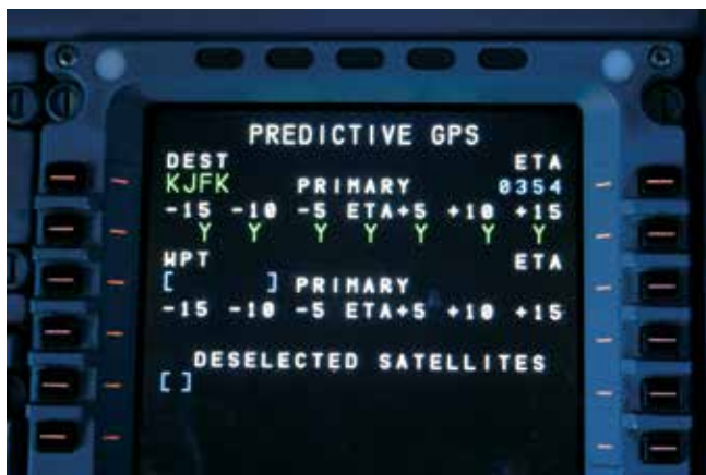
Figure 1: A typical FMS/GPS unit's predictive GPS (or RAIM) page. Note that it displays the flight's destination (top left), ETA (top right), and the predicted availability of terminal/approach level GPS coverage at the ETA and plus/minus 5, 10, and 15 minutes of the ETA (the green "Y" indicating "yes"). A RAIM check of a specific waypoint (other than the destination) could be manually selected, as well.

terminal operations at the ETA. RAIM predictions can be acquired a variety of ways, including from Flight Service, the FAA website, or via the RAIM Prediction feature built into many IFR-certified GPS and FMS units. While WAAS GPS receivers perform RAIM checks continuously, non-WAAS units only perform an automatic RAIM check prior to commencing an approach. For non-WAAS users, the FAA recommends pilots perform manual RAIM checks before departure and as often as feasible before flying a GPS approach procedure (Figure 1). Additionally, non-WAAS GPS users must perform RAIM prediction checks prior to flying T and Q-Routes (GPS-based airways), or RNAV Arrival and Departure procedures (SIDs, STARs and ODPs). WAAS users are exempt from those requirements, assuming they are operating in WAAS coverage areas. Not only do WAAS-certified GPSs check RAIM automatically (within WAAS coverage areas), but they will also annunciate any RAIM-related problems. In the event a RAIM check fails, GPS approach procedures are not approved and the pilot must resort to visual or other means of approach navigation (VOR, LOC, etc.). Assuming the flight was planned legally, there should always be a non-GPS approach available at the destination and/or alternate airport (or VFR conditions forecast) to ensure the flight can be completed in the absence of available GPS navigation. For more specific details on GPS navigation and RAIM, refer to the Aeronautical Information Manual (AIM), 1-1-19.