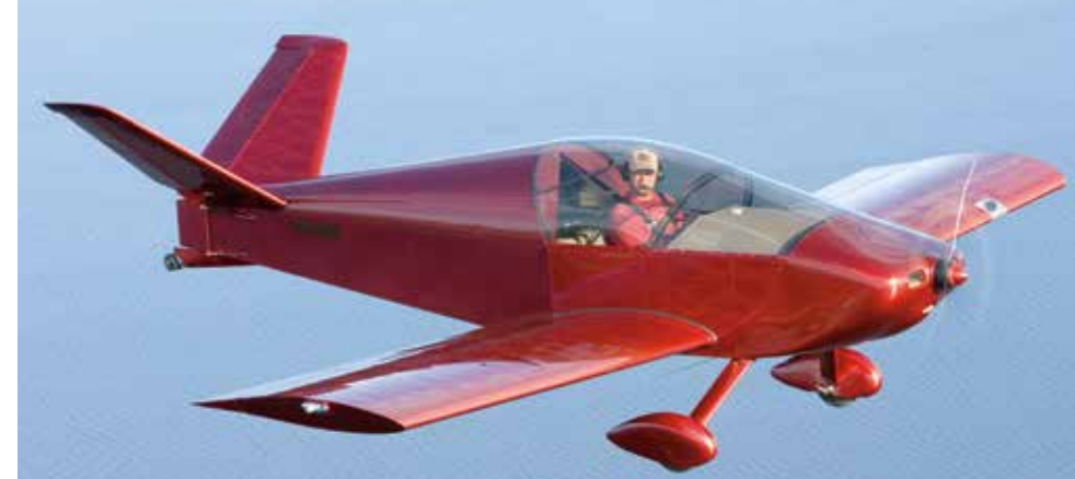
The first customer completed Waiex (kit #024) sports a bold paint job to accentuate its pleasing lines and sporty performance.