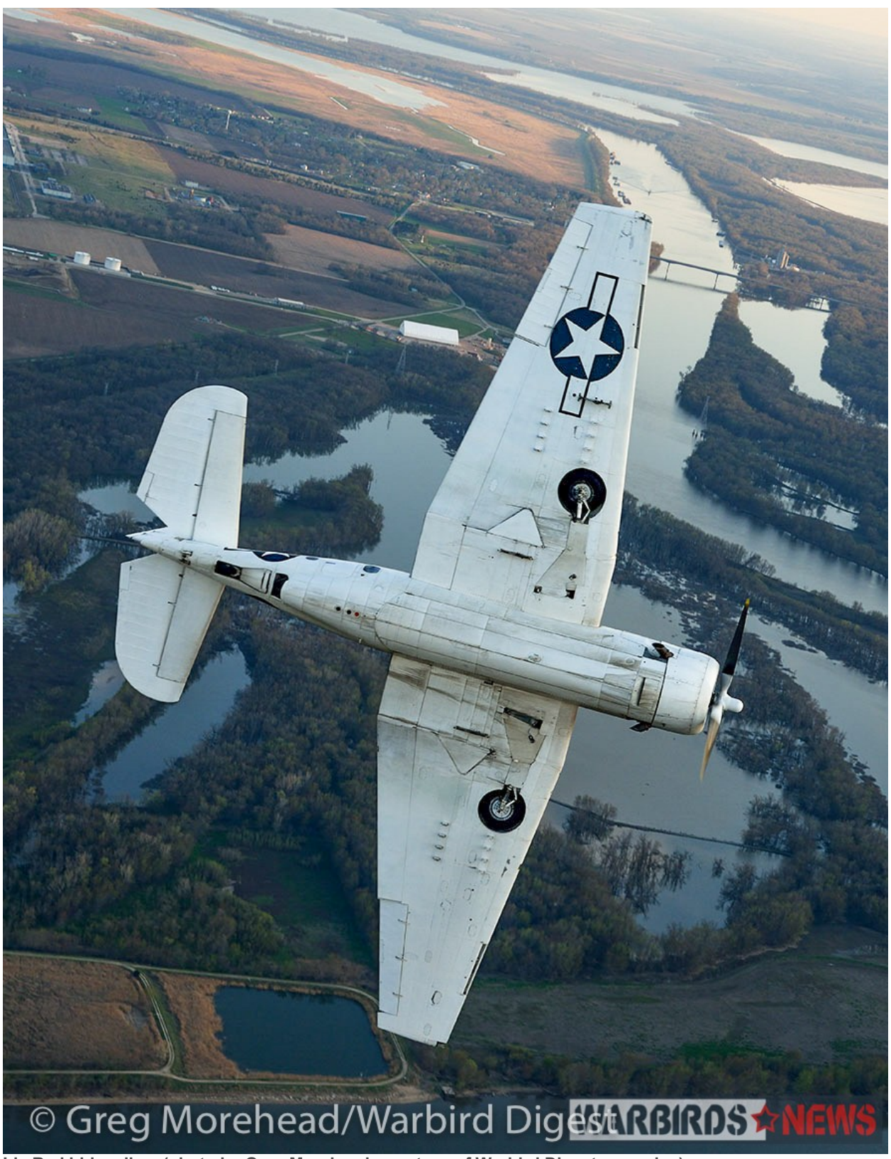
Ida Red bids adieu.