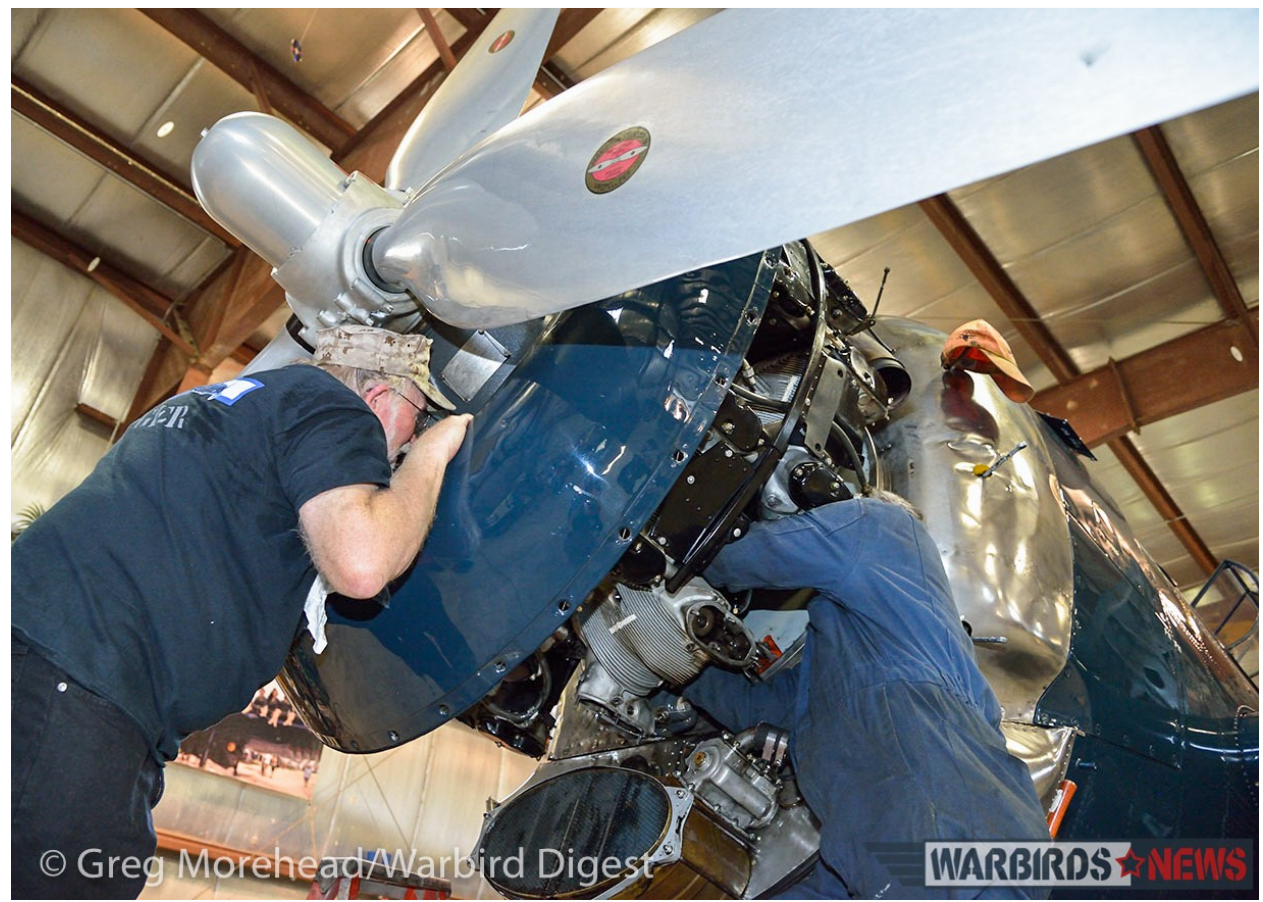
Working on the engine of the recalcitrant Avenger.

"Imposing" is an apt descriptor, even for a single Avenger. However, eight or nine Avengers parked side-by-side only magnifies that impression. Some variants weigh in with a max takeoff weight of nearly 18,000 lbs.... that's nine tons! Grumman personnel referred to the plane as the Turkey during its development. That nickname and others were used by Avenger flight and ground crews, more to describe the plane's ungainly appearance than its performance (which was quite good in nearly every respect, in spite of its size and bulky appearance). Nine tons of torpedo-toting Turkey cannot be ignored any more by airport crowds today than it could have been by axis seamen watching it bare down on them to drop a shallow-running Mk XIII torpedo meant to dispatch their vessel to the ocean floor.