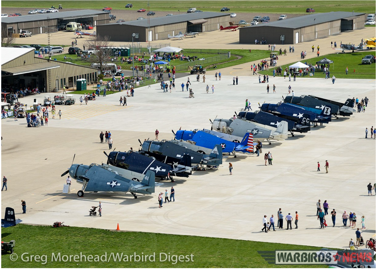
Eight of the ten TBM's that flew from Peru, Illinois during the Avenger Gathering.

Twenty miles northeast of Illinois Valley Regional Airport, I selected the airport's Common Traffic Advisory Frequency (CTAF) and was immediately bombarded with a non-stop barrage of position reports by the dozens of airplanes descending upon Peru, IL. Several radio calls were between the TBM Avengers that were airborne south of KVYS and assembling into a 9-ship formation. About 10 miles out, the gaggle of TBM's came into view, appearing as a mighty Tour de Force on the horizon. Soon after I'd landed, the Avengers made a series of fly overs before their recoveries onto Illinois Valley's Runway 18. In military parade fashion, each Avenger folded its wings exiting the taxiway and parked as a picturesque row of eight TBM's across the apron. A ninth TBM parked at a staging location for giving rides to lucky passengers, as a tenth Turkey underwent maintenance while 'roosting' in a nearby hangar. Ten airworthy examples of Grumman's giant torpedo bomber haven't assembled in a single location since the type was still a staple of the air tanker fleet in the 1980s. However, the last time that so many flying, military-configured TBM's got together must have been around 1960!