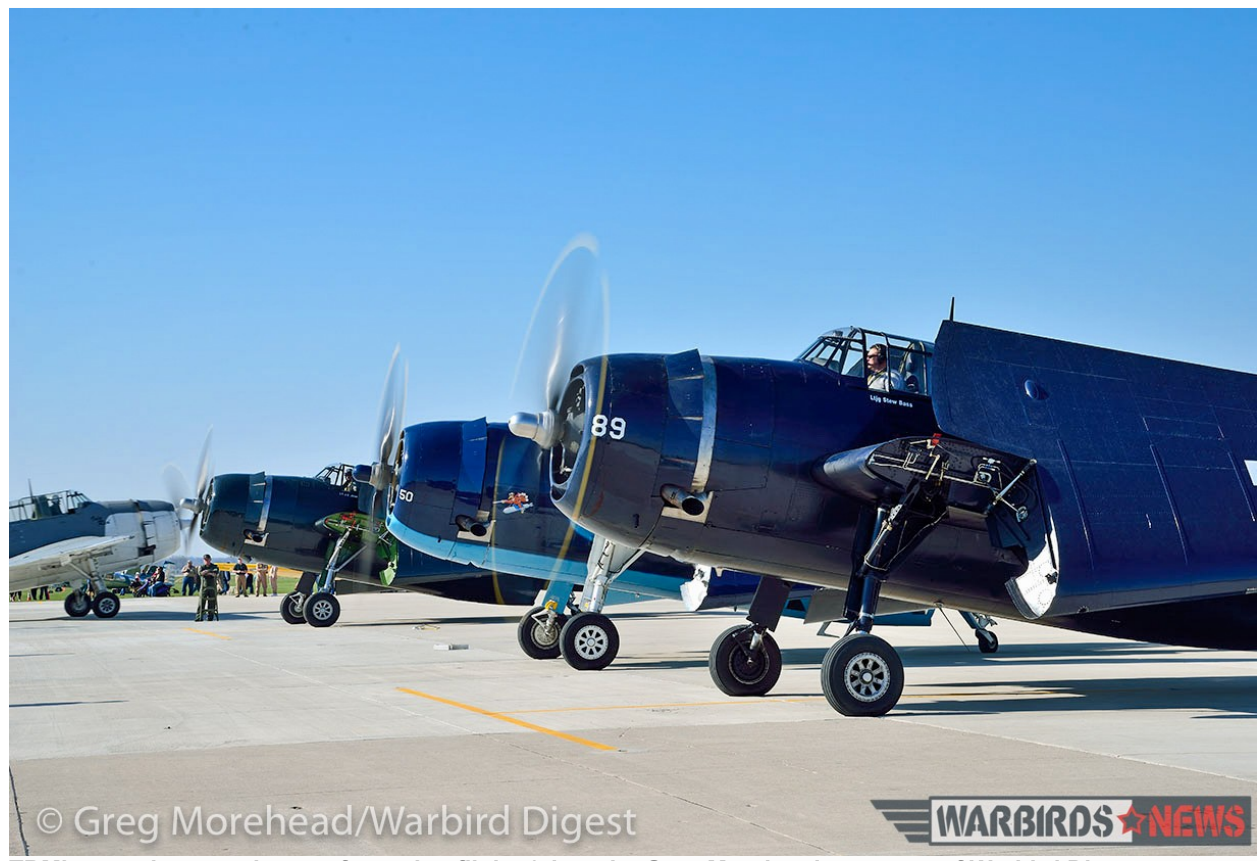
TBM's warming up prior to a formation flight.

Avengers served US Navy and Marine squadrons throughout WWII, making their combat debut, in June 1942, at the Battle of Midway. Allied nations also operated several variants of the Avenger throughout the war. Postwar, Avengers continued to sever in many military roles, most notably within the Royal Canadian Navy, who retained Avengers until July, 1960. Yet, the capability of the Avenger that helped ensure the survival of so many airframes today was almost exactly the opposite of what it was designed to do. As a torpedo bomber, the Avenger's job was to rain hellfire upon enemy warships. Ironically, in civilian life, they were found to be equally adept at extinguishing fires, as water bombers. Thus, they flew extensively in both firefighting and aerial application missions. Amazingly, the last Avenger wasn't retired from such roughneck civilian duty until 2012 (71 years after the design first flew)!